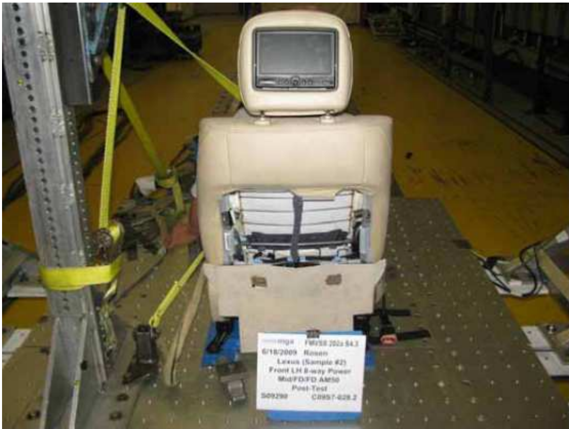
Post-Test Photo #4 of Test #S09290