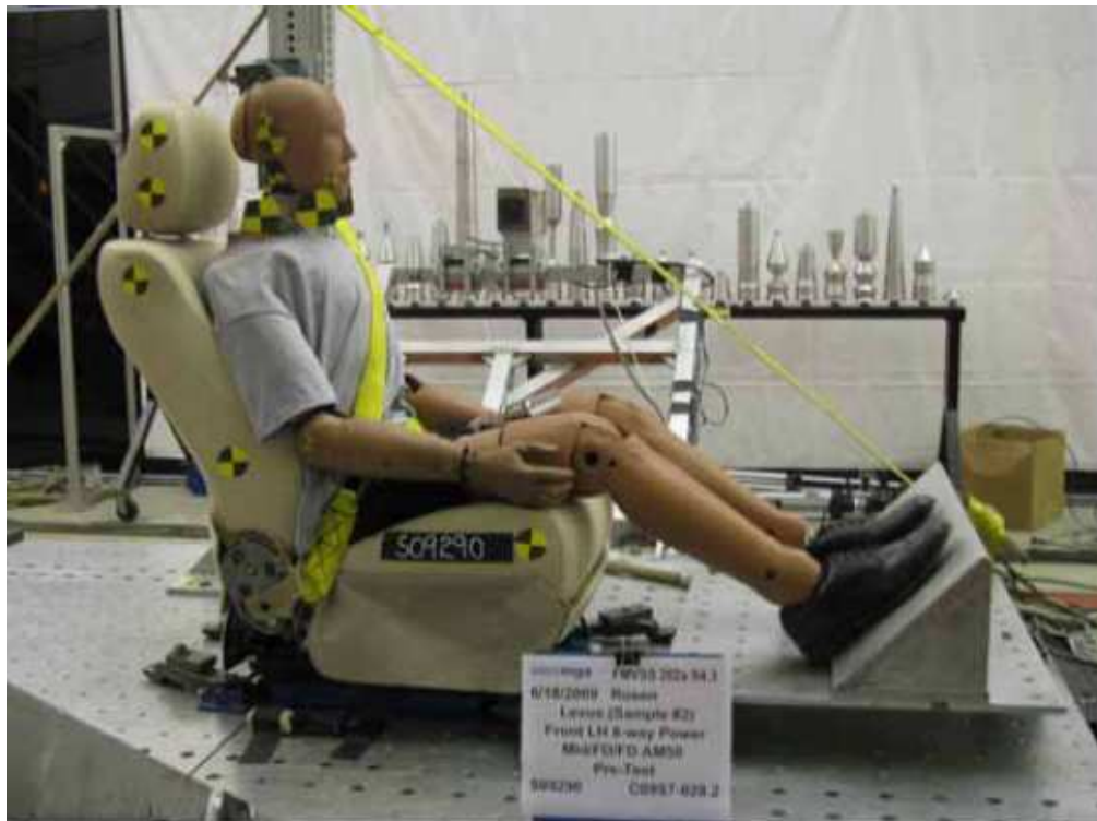
Pre-Test Photo #3 of Test #S09290